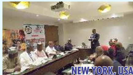
NEW YORK, USA