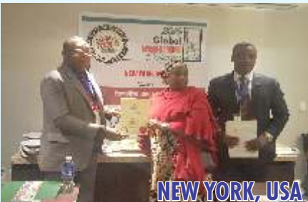
NEW YORK, USA